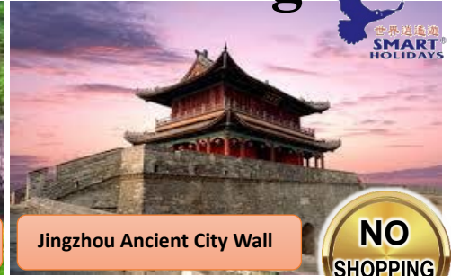
Jingzhou Ancient City Wall