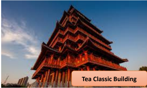
Tea Classic Building