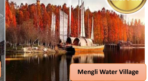
Mengli Water Village

DAY 1 Kuala Lumpur → Wuhan 高铁 Tian men 巴士 Yi chang MOB / L / D