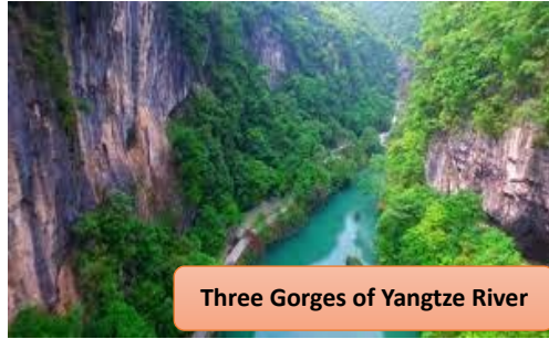
Three Gorges of Yangtze River