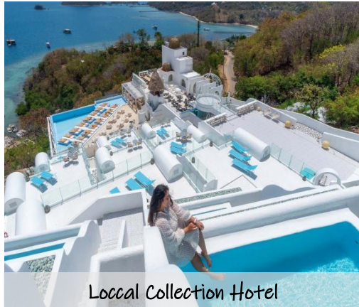
Loccal Collection Hotel