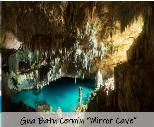
Gua Batu Cermin "Mirror Cave"