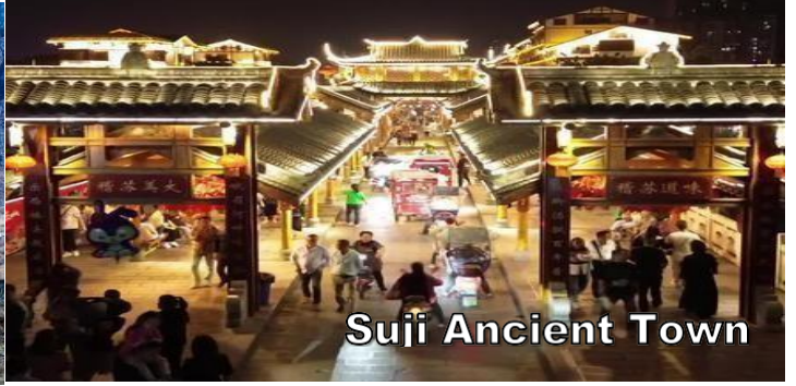
Suji Ancient Town