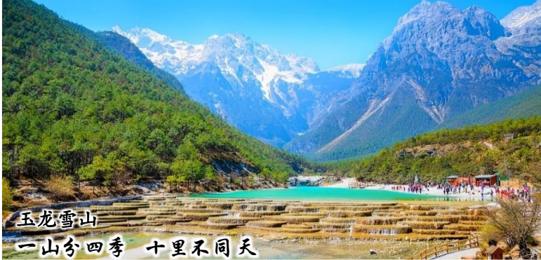
玉龙雪山 一山分四季 十里不同天