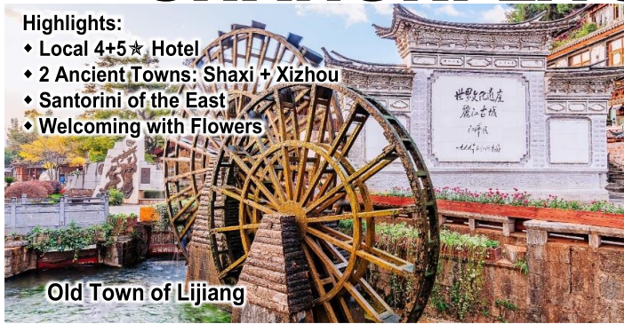
Old Town of Lijiang