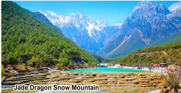
Jade Dragon Snow Mountain