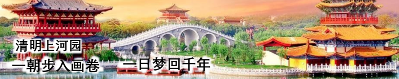
清明上河园 一朝步入画卷 一日梦回千年