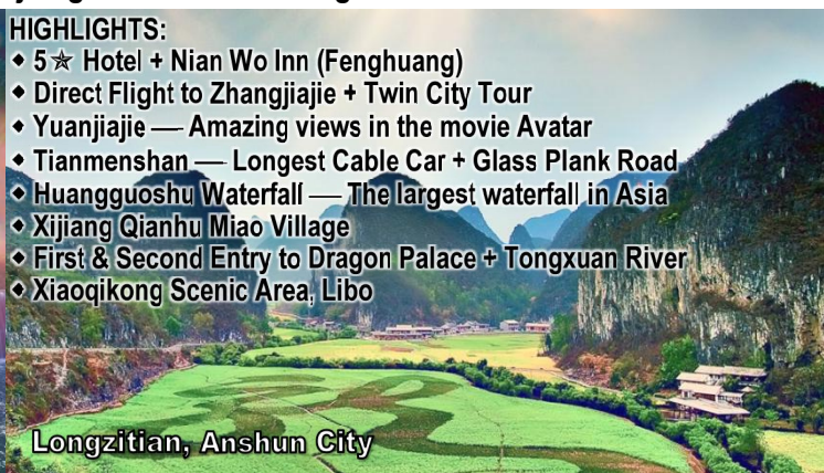
Longzitian, Anshun City