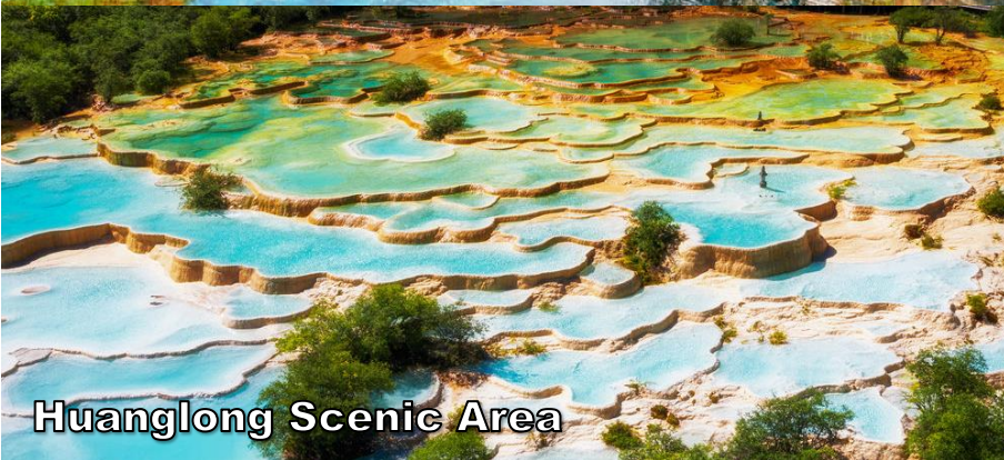
Huanglong Scenic Area