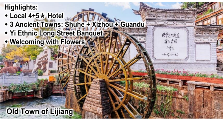
Old Town of Lijiang