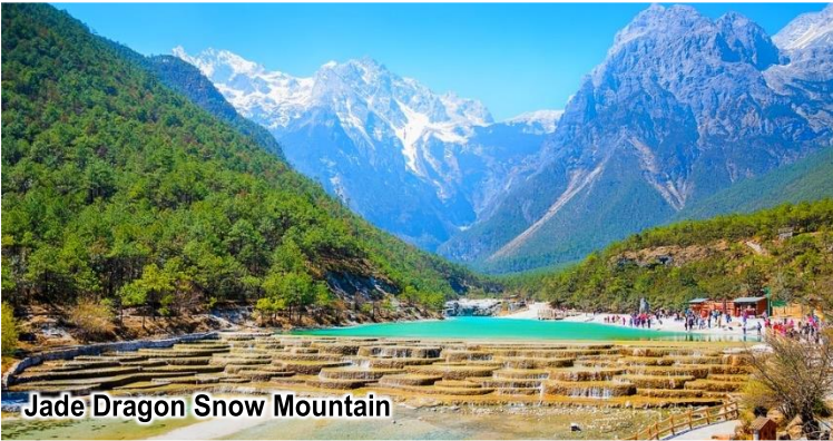
Jade Dragon Snow Mountain