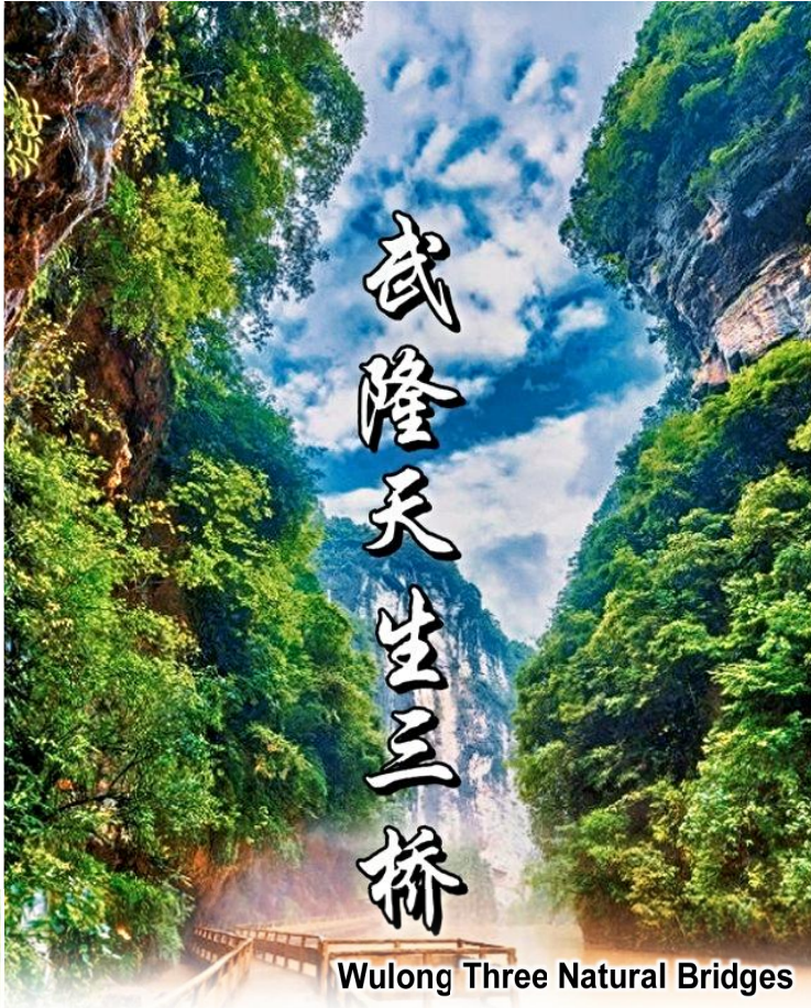
Wulong Three Natural Bridges