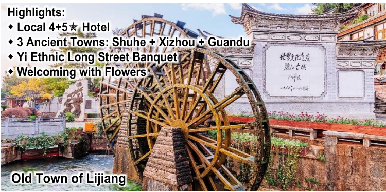
Old Town of Lijiang