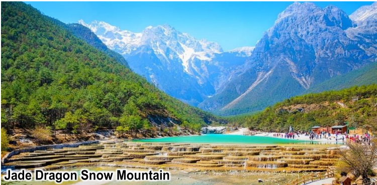
Jade Dragon Snow Mountain