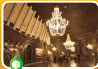
Wielicka Salt Mine 维克利卡盐矿