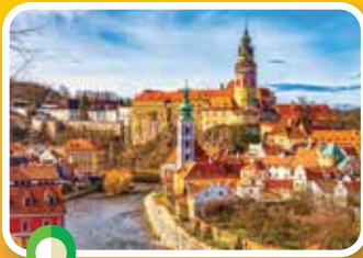
Castle of Cesky Krumlov 捷克克鲁姆洛夫城堡

Czech Republic • Poland • Slovakia • Hungary • Austria • Bavaria Germany 捷克共和国 • 波兰 • 斯洛伐克 • 匈牙利 • 奥地利 • 巴伐利亚德国