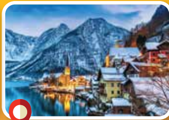
Hallstatt, Austria ~ one of the most beautiful places in the world 游览被誉为全世界最美 的小镇~奥地利, 哈尔施塔特