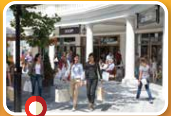
McArthurGlen Designer Outlets 欧洲名牌Outlet 尽情享受购物乐趣