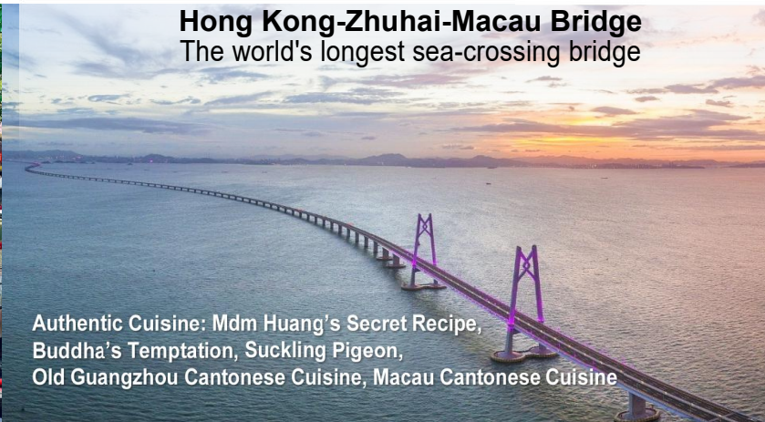
Hong Kong-Zhuhai-Macau Bridge The world's longest sea-crossing bridge

Authentic Cuisine: Mdm Huang's Secret Recipe, Buddha's Temptation, Suckling Pigeon, Old Guangzhou Cantonese Cuisine, Macau Cantonese Cuisine