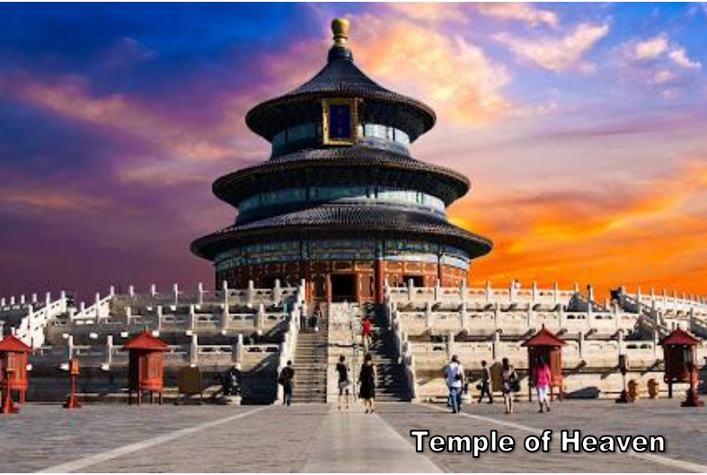
Temple of Heaven