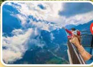
Rong May Glass Bridge 龙云玻璃桥