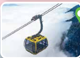
Fansipan - Take the world's largest 3 cableway 番西邦乘搭世界最长三索道缆车