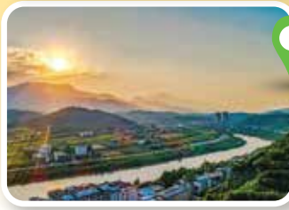
Overlooking the most border "HeKou County" in Yunnan, China 眺望中国云南最边境“河口县”