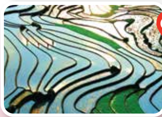
Cat Cat Village - Enjoy the "World's 7 Greatest Chinmei Terraces" 格格村欣赏“世界七大奇美梯田”