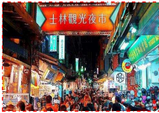
Shilin Night Market

Shilin Night Market is a night market in the Shilin District of Taipei, Taiwan, and is often considered to be the largest and most famous night market in the city.