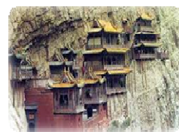
HENGSHAN SPECTACLE - MONASTERY