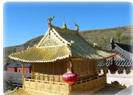
HIN TONG TEMPLE