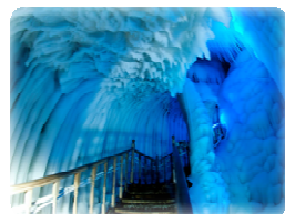
THOUSAND YEARS CAVE